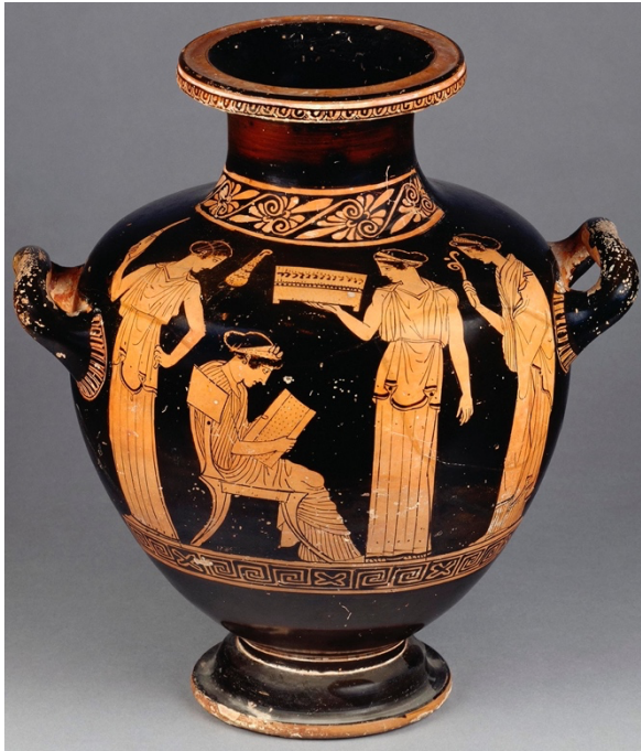
Image: Attic red-figure hydria (water-jar), c. 450 BC. British Museum 1885,1213.18.